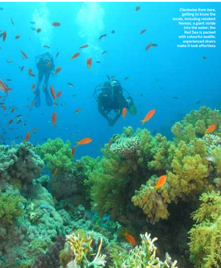
Clockwise from here, getting to know the locals, including resident Nemos; a giant stride into the water; the Red Sea is packed with colourful sealife; experienced divers make it look effortless